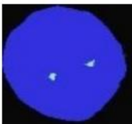
Interphase cell showing two copies of chromosome 18 (Aqua).