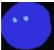
Interphase cell showing two copies of chromosome 18 (Aqua).

Disclaimer: Although the methodology used in this analysis and interpretation is highly accurate, it does not detect small rearrangements and very low-level mosaicism, which are detectable only by molecular methods. Failure to detect an alteration at any locus does not exclude the diagnosis of any of the disorders.