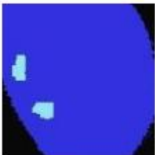
Interphase cell showing two copies of chromosome 18 (Aqua).

Disclaimer: Although the methodology used in this analysis and interpretation is highly accurate, it does not detect small rearrangements and very low-level mosaicism, which are detectable only by molecular methods. Failure to detect an alteration at any locus does not exclude the diagnosis of any of the disorders. LABASSURE can assist the physician in determining the appropriate test in the context of clinical indications. This report has been reviewed and electronically signed by: