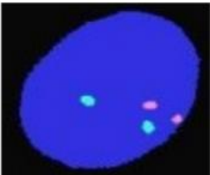
Interphase cell showing two copies of chromosome 13 (green) and chromosome 21 (orange).